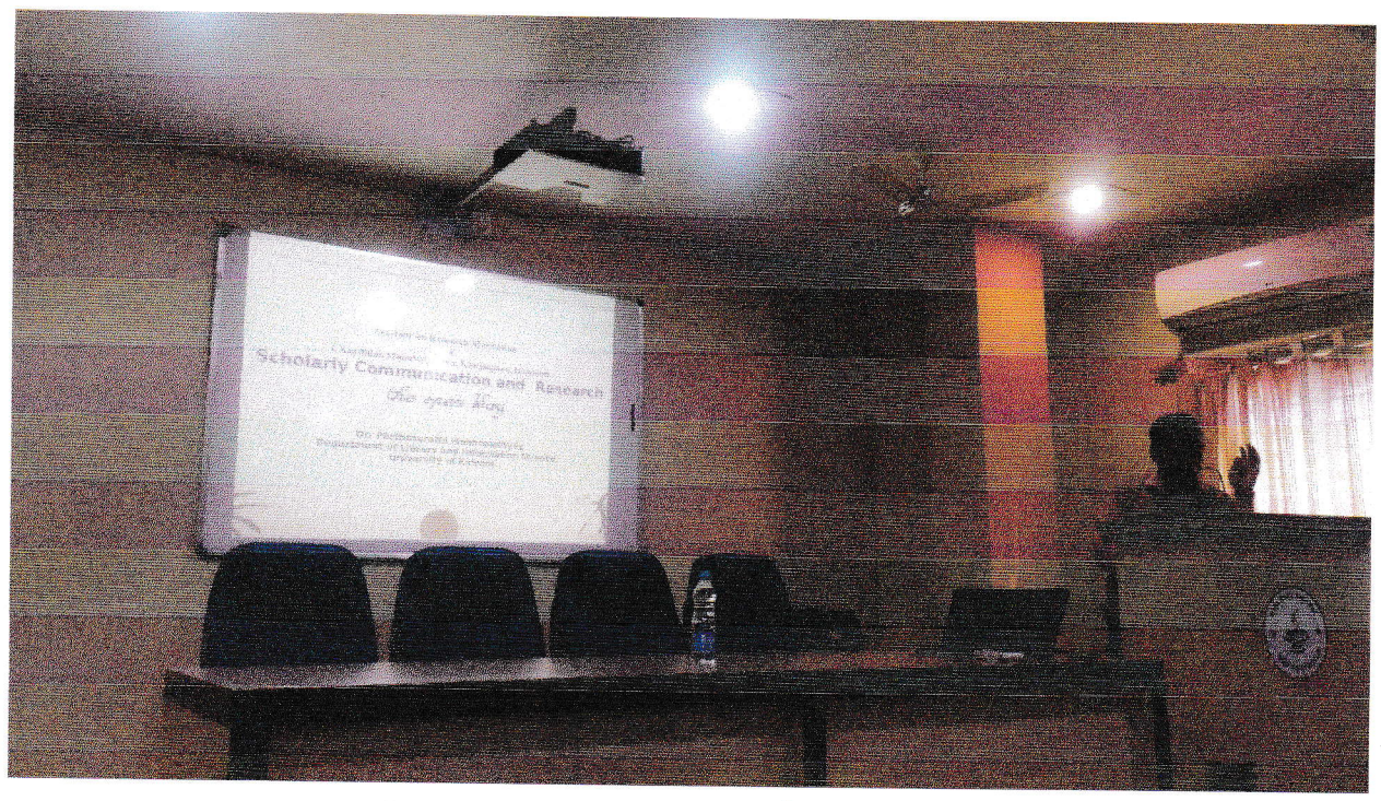
Promotion & Motivation of Research

Coordinator Internet Quality Assurance Cell (IQAC) Chandidae Mahavidyalaya Khujutipera, Birbhum, W.B.