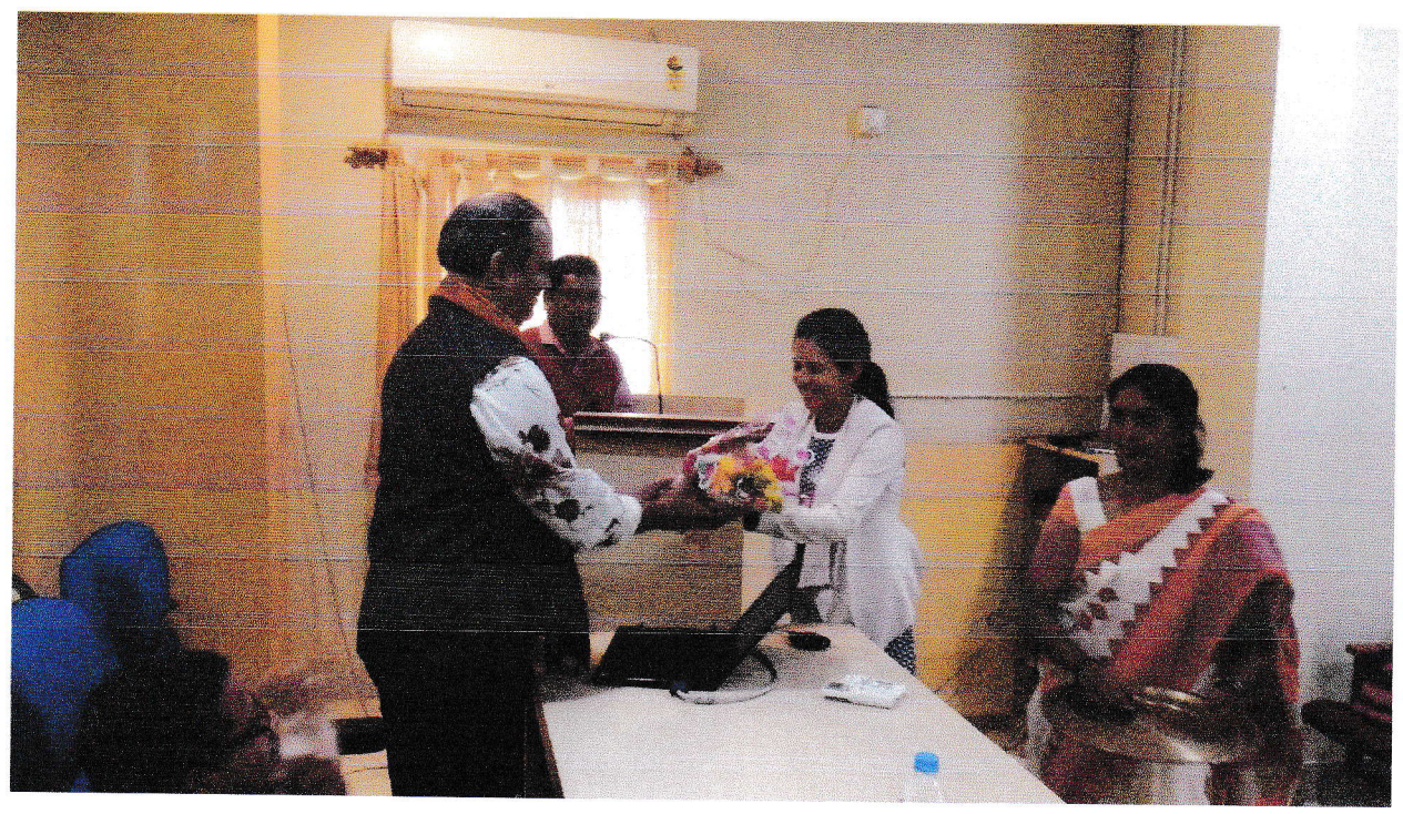
Promotion & Motivation of Research